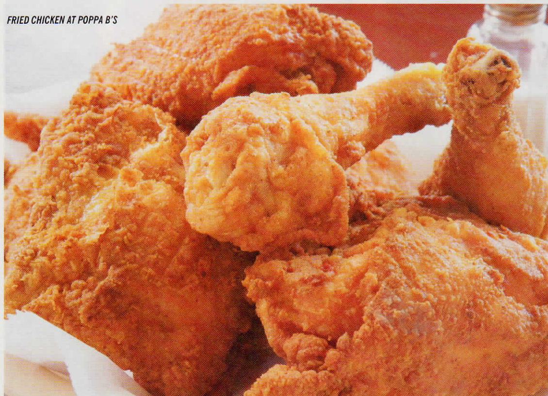
FRIED CHICKEN AT POPPA B'S

The Friendly Toast Bostonians take a mostly dim view of the world outside our fair city. Just because your Portsmouth, New Hampshire restaurant inspires cult-like fervor up the coast doesn't mean it will impress us here in